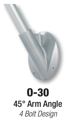
0-30 45° Arm Angle 4 Bolt Design