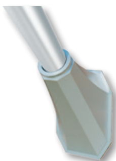
0-32 45° Arm Angle 4 Bolt Design